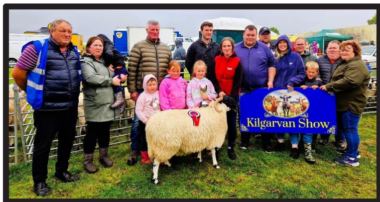
Supreme Champion of Kilgarvan Show – Winner of the Patrick O'Sullivan (Sean) cup