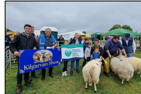
Killarney /Kenmare/Cahersiveen Credit Union sponsoring Sheep prizes at Kilgarvan Show 2024