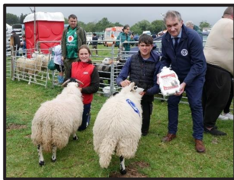
The Ectofly Ewe Lamb - All Ireland Championship at Kilgarvan Show 2024